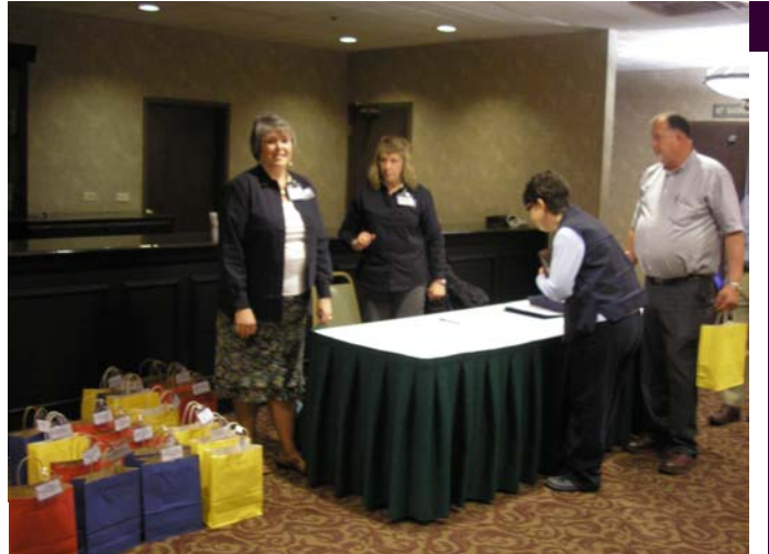
Registration and bags of conference materials.